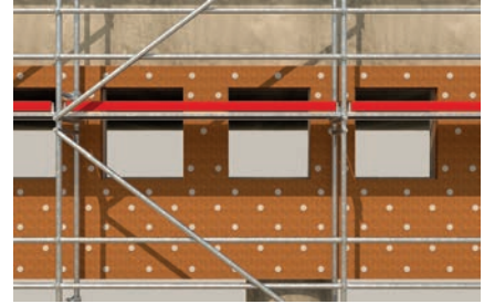
Pressure-resistant insulating materials in curtain façades