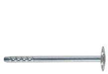
DHM, washer- \varnothing 35 mm