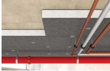
Pressure-resistant insulating materials on ceiling undersides