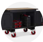
Mobile TuffBench MBH12

Disclaimer: all dimensions and weights are approximate