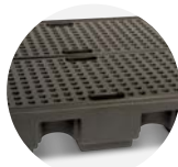
DrumBank Pallet DBP4