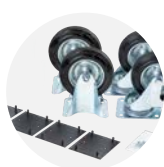
Castor Kit CASS1

Disclaimer: all dimensions and weights are approximate