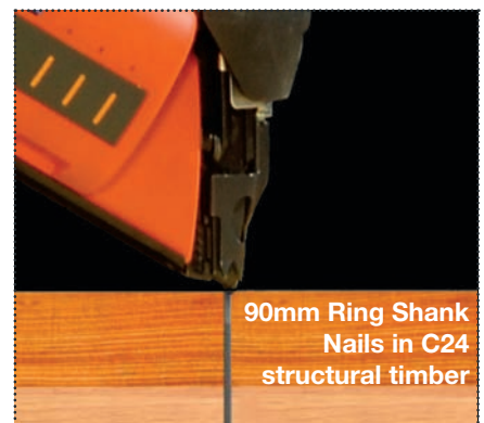
90mm Ring Shank Nails in C24 structural timber