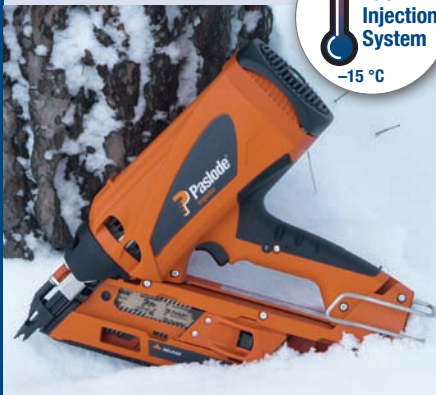
Unrivalled cold weather performance