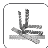
Clips & Brackets