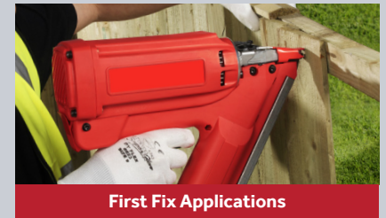
First Fix Applications